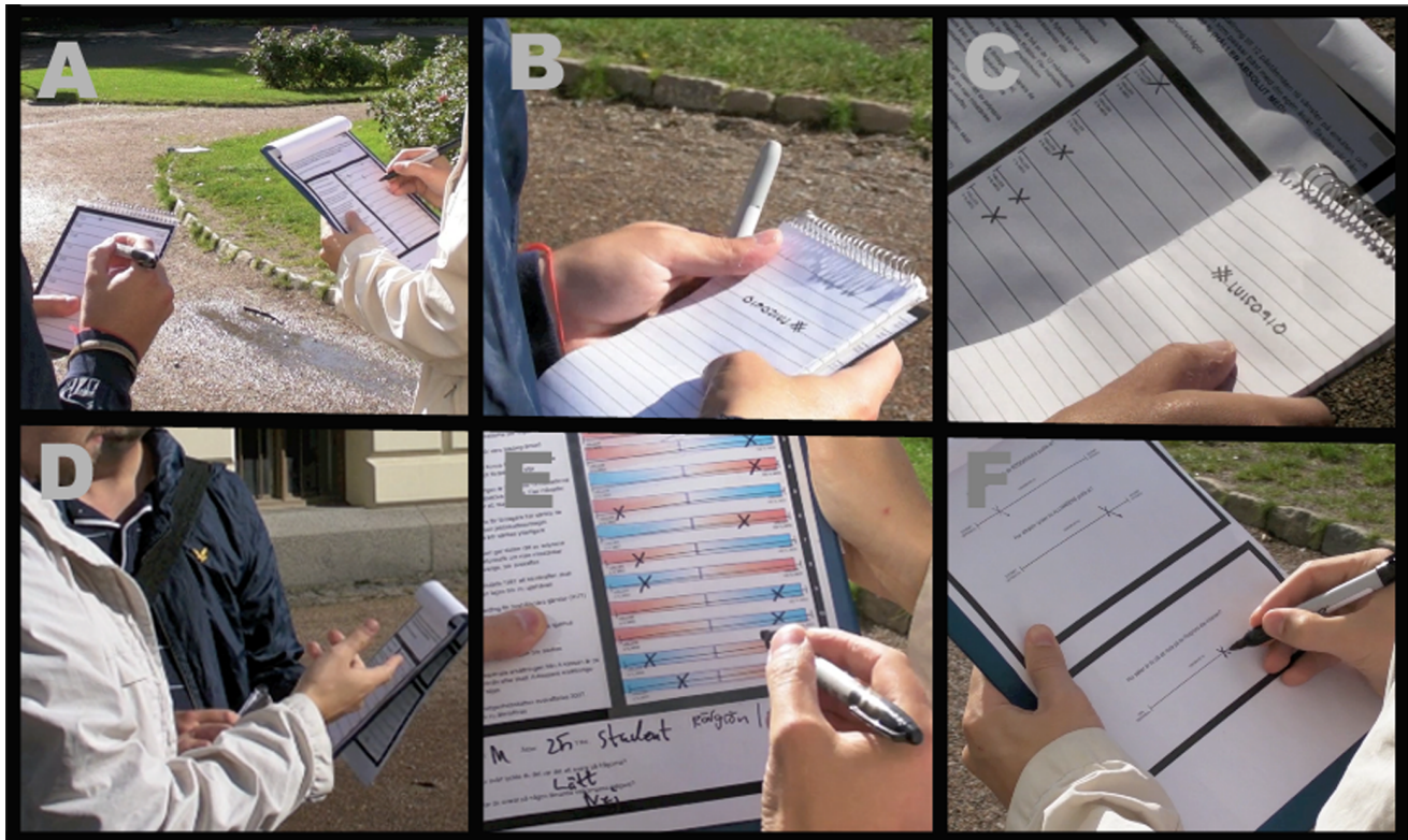
Figure 1. A step-by-step demonstration of the manipulation procedure. A. Participants indicate the direction and strength of their voting intention for the upcoming election, and rate to what extent they agree with 12 statements that differentiates between the two political coalitions. Meanwhile, the experimenter monitors the markings of the participants and creates an alternative answering profile favoring the opposite view. B. The experimenter hides his alternative profile under his notebook. C. When the participants have completed the questionnaire, they hand it back to the experimenter. The backside of the profile is prepared with an adhesive, and when the experimenter places the notebook over the questionnaire it attaches and occludes the section containing the original ratings. D. Next, the participants are confronted with the reversed answers, and are asked to justify the manipulated opinions. E. Then the experimenter adds a color-coded semi-transparent coalition template, and sums up which side the participants favor. F. Finally, they are asked to justify their aggregate position, and once again indicate the direction and strength of their current voting intention. See http://www.lucs.lu.se/cbp for a video illustration of the experiment. doi:10.1371/journal.pone.0060554.g001

the analysis. After the study, the experimenter took notes about the comments and explanations of the participants.